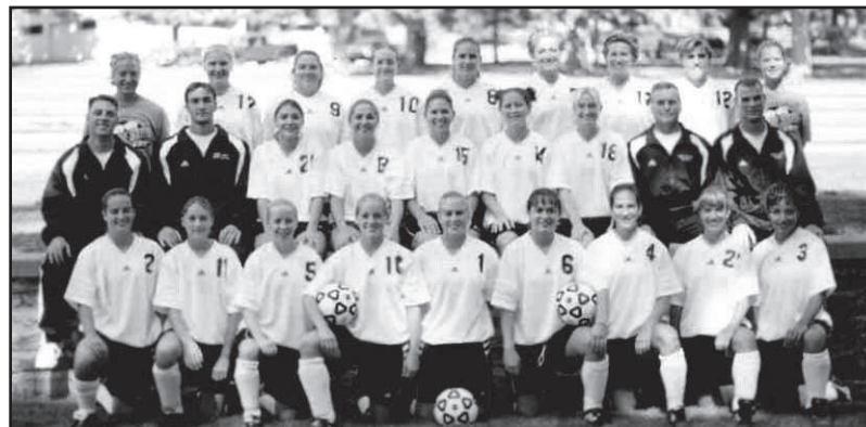
The 2000 WSC soccer team won a school record 18 games, going 18-4-1.